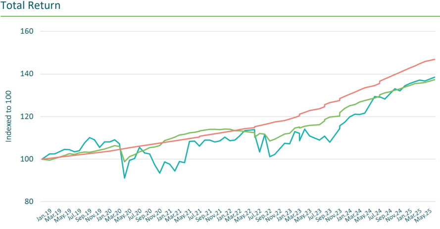
Mid-market price total return Benchmark*