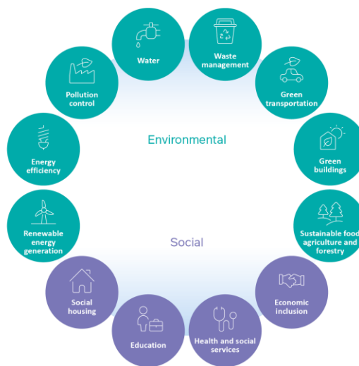
Figure 3: Broad range of impact opportunities in private debt that could deliver against the Global Goals

The UN Sustainable Development Goals (SDGs) have become a shared lexicon for impact investors to articulate how the impact of investments could deliver against the Global Goals. When mapping impact opportunities to the SDGs, we focus on making clear, tangible links.