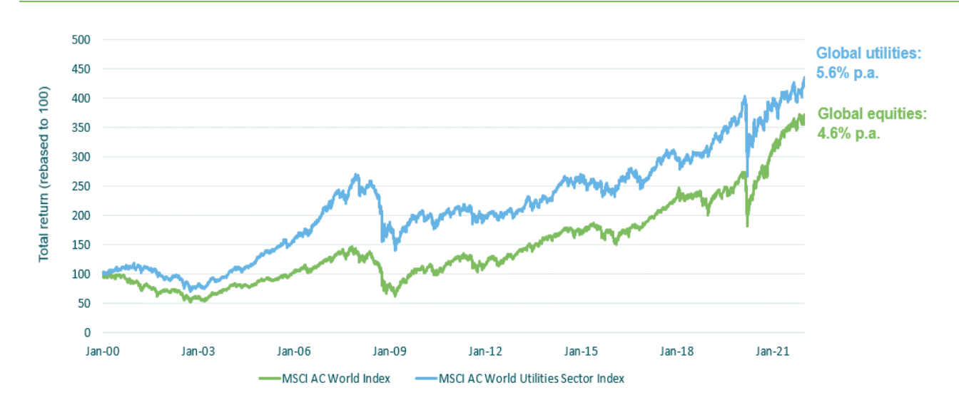
Figure 1: MSCI ACWI Utilities vs MSCI ACWI

Past performance is not a guide to future performance.