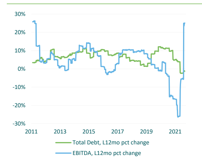
Figure 1. US HY issuers' total debt vs EBITDA (last 12m % change)

The recent quarterly earnings season has again highlighted just how strong the underlying recovery remains for many companies around the world, including for many high yield bond issuers. Third-quarter earnings were generally quite strong across the board, following on from a blockbuster second quarter, despite many firms having to digest rising input costs and navigate supply chain blockages. Rising inflation so far has been compensated for by strong revenue growth, and the margin compression that many had feared has not materialised yet. Clearly there are risks investors need to be aware of from here, some of which we will address later in this piece. But provided there is no sting in the recovery tail, we are able to outline several reasons why